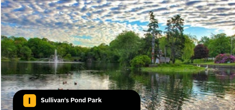
I Sullivan's Pond Park

Named one of Canada's hippest neighbourhoods, this cool and quirky borough has something for everyone. Hop on the ferry and explore Downtown Dartmouth on foot or take a short drive over one of the Harbour Bridges - either way, the views are breathtaking. You haven't seen the Halifax Harbour until you've seen it from both sides.