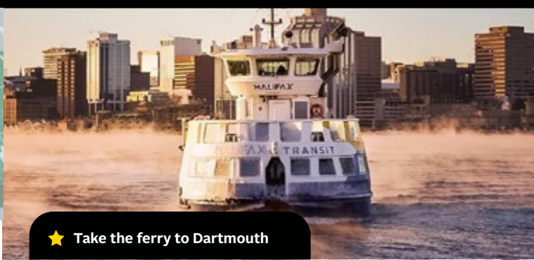
★ Take the ferry to Dartmouth