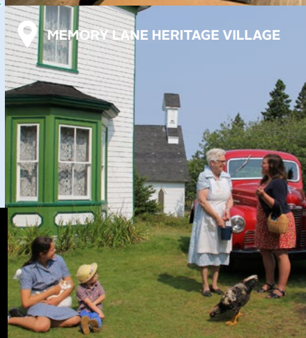
MEMORY LANE HERITAGE VILLAGE