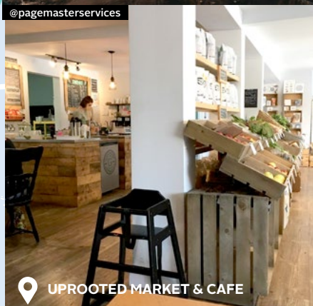
UPROOTED MARKET & CAFE