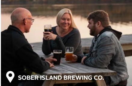
SOBER ISLAND BREWING CO.