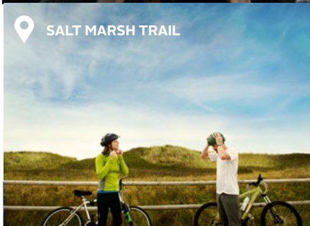
SALT MARSH TRAIL